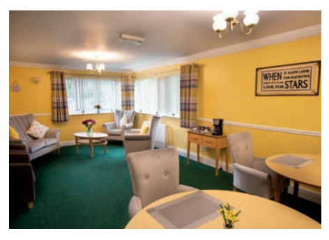
A purpose built, welcoming and spacious home offers a thoughtfully planned environment for all needs and lifestyles.