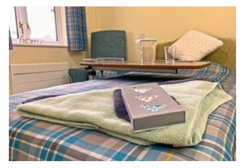
Wonderful personal, private and communal spaces are designed to provide a comfortable and relaxing environment, promoting good mental and physical wellbeing.