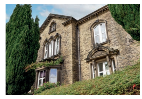
We provide residential and nursing care tailored to suit a range of individual and personal needs.