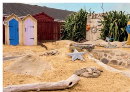
A day out on Appleby Beach! A comfortable, relaxing environment to help promote good mental and physical wellbeing - and fun!