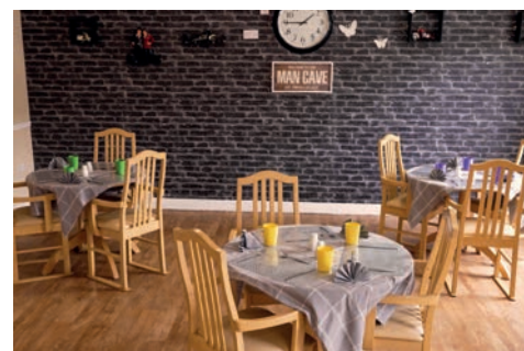
A versatile, specialist and expert team We are also home to a self-contained nursing environment specifically designed to support those who may benefit from living in a male only setting.